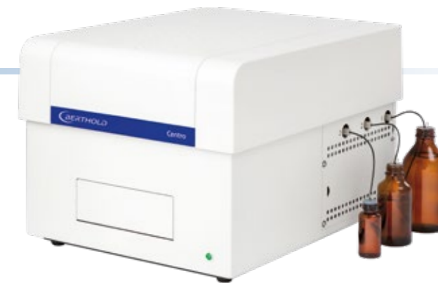
Figure 2: The optional injectors are integrated into the housing of the system to save precious bench space.