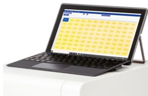
Figure 1: The Centro has a flat surface on its top, providing enough space to put down a laptop.