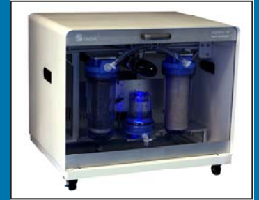
AQUAS-10 Water Conditioner

** Layer of hollow polypropylene spheres (1.4 inch diam) added to the AIMS III (S) tank, reducing the surface area and limiting oxygen re-absorption