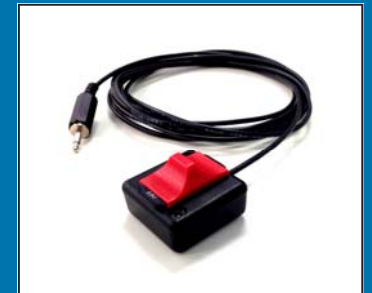
Remote ON/OFF Pump Switch