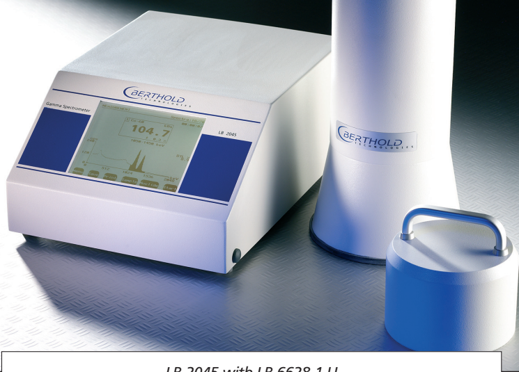
LB 2045 with LB 6628-1 U

A 2" well-type detector as integral line is used as standard scintillation probe.