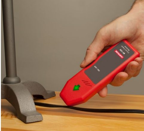
Designed for use in residential and light commercial environments.