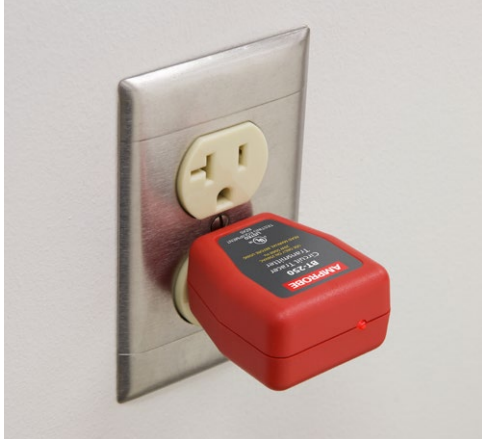
Plug the transmitter into an outlet and receiver will find the corresponding breaker.