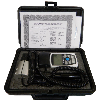
ST-FT1 complete with Calibrator Kit now available