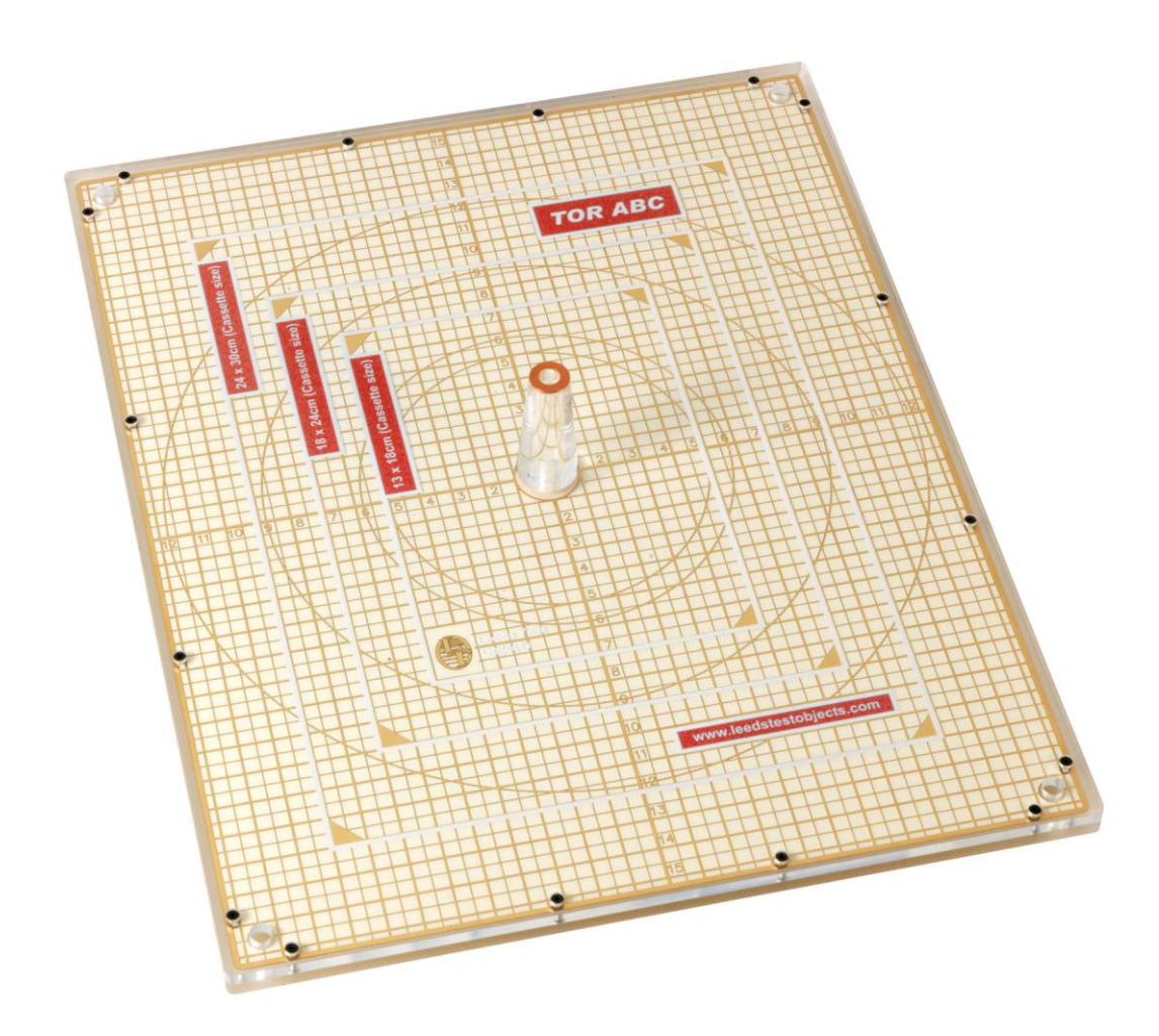
fig. 1 TOR ABC